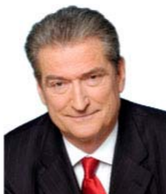
The Prime Minister Prof. Dr. Sali Berisha